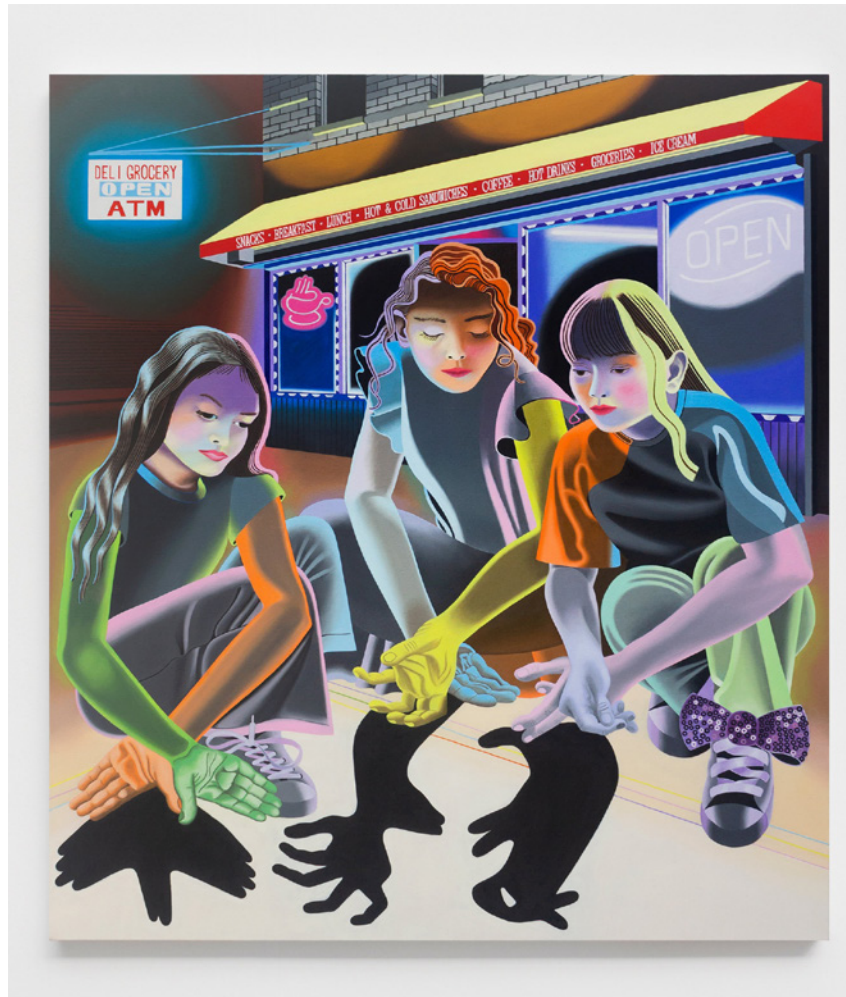
Leigh Ruple's "Friendship" (2020). Credit... Leigh Ruple, Page (NYC) and Independent Art Fair