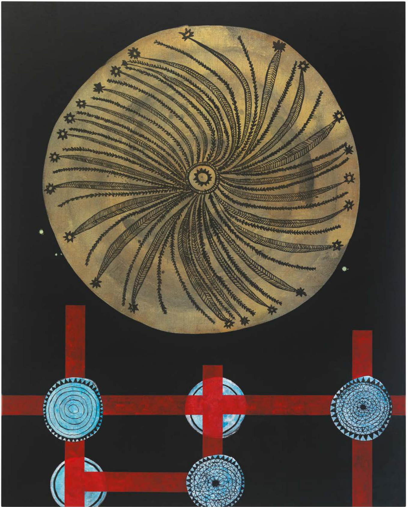
Roy Dowell, untitled #1166 , 2020.