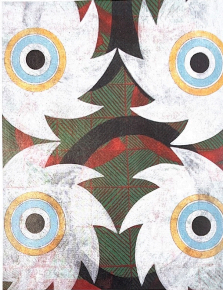
Roy Dowell, untitled #1179 , 2022.

Roy Dowell's acrylic paintings are abstractions filled with interlocking and overlapping shapes of differing opacities. Though created from the depths of his imagination, Dowell's many works reference textile designs, floral patterns, Tantric diagrams and mandalas, cosmological maps, illuminated manuscripts, as well as early 20th-century abstractions by painters such as Hilma af Klint and