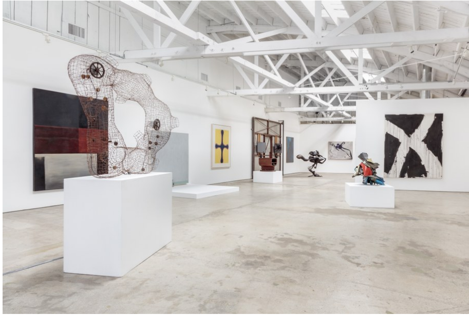
Dilexi Gallery: Disparate Ontologies runs until August 10th, 2019 at the Landing Gallery.