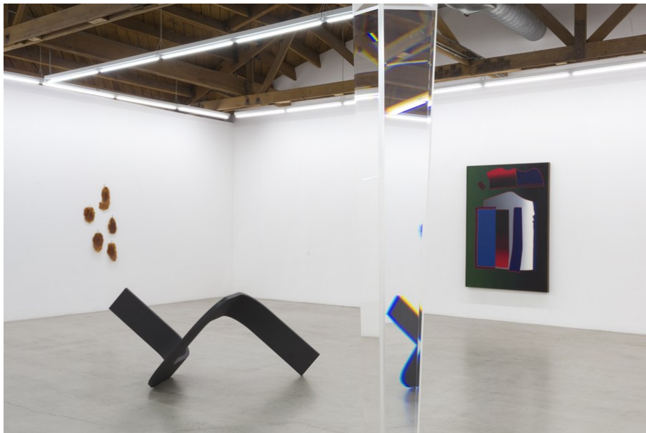
DILEXI: Totems and Phenomenology runs until August 10th, 2019 at the Parrasch Heijnen Gallery.