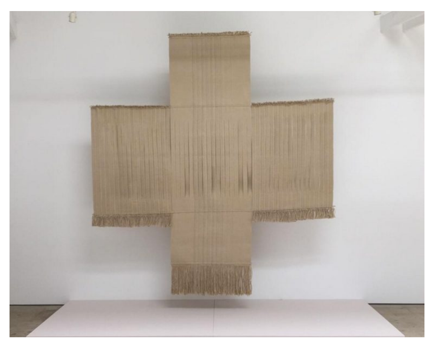
Lenore Tawney, "Dove" (1974)