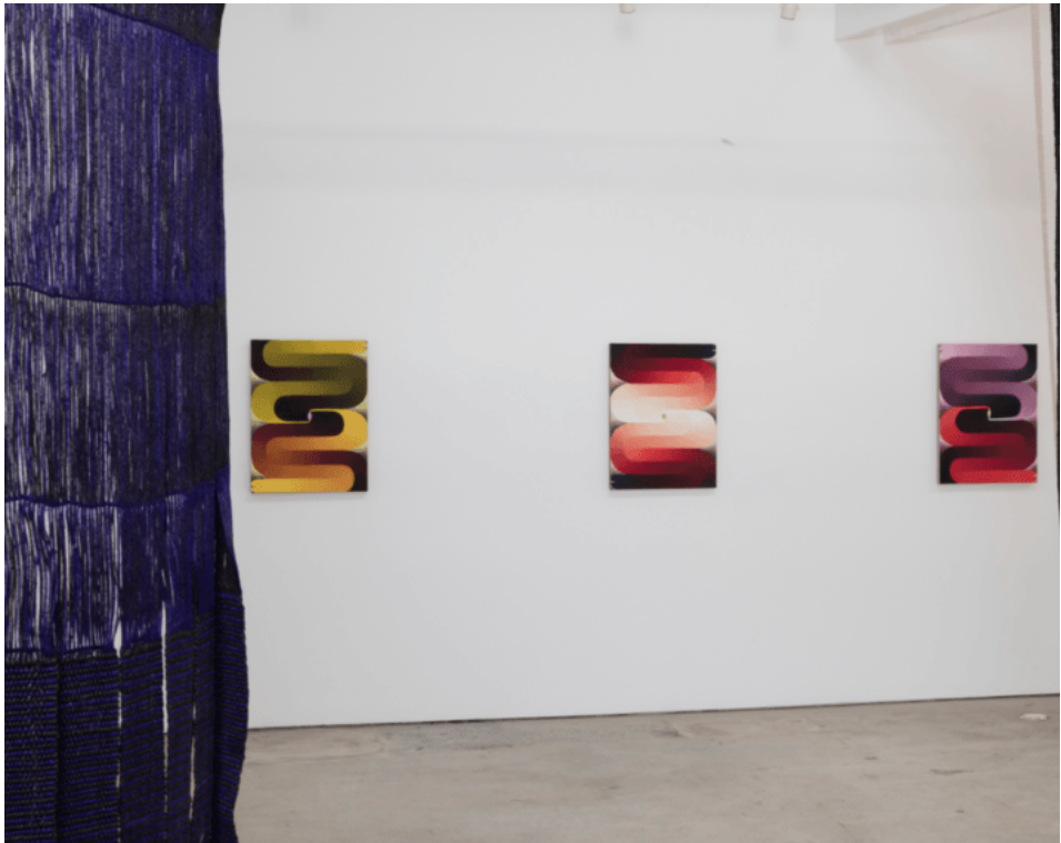
3 Women at The Landing (installation view). Image courtesy of the artists and the Landing, Los Angeles. Photo: Joshua White/JW Pictures.

inches. Image courtesy of the artists and the Landing, Los Angeles. Photo: Joshua White/JW Pictures.