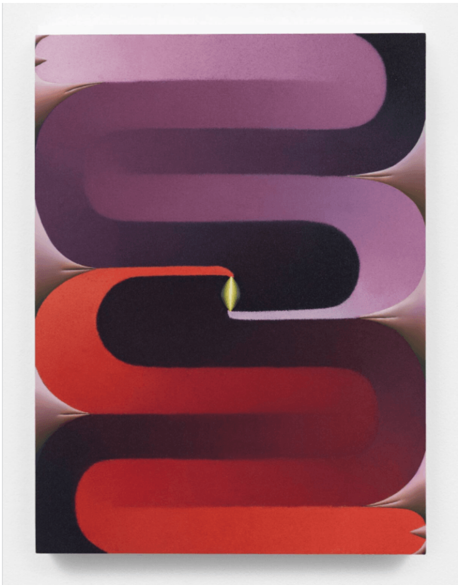
Loie Hollowell, Stacked Lingham in Purple, Red, Green (2016). Oil and modeling paste on linen and panel, 28 x 21 inches.