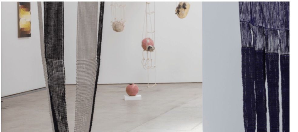
3 Women at the Landing (installation view).