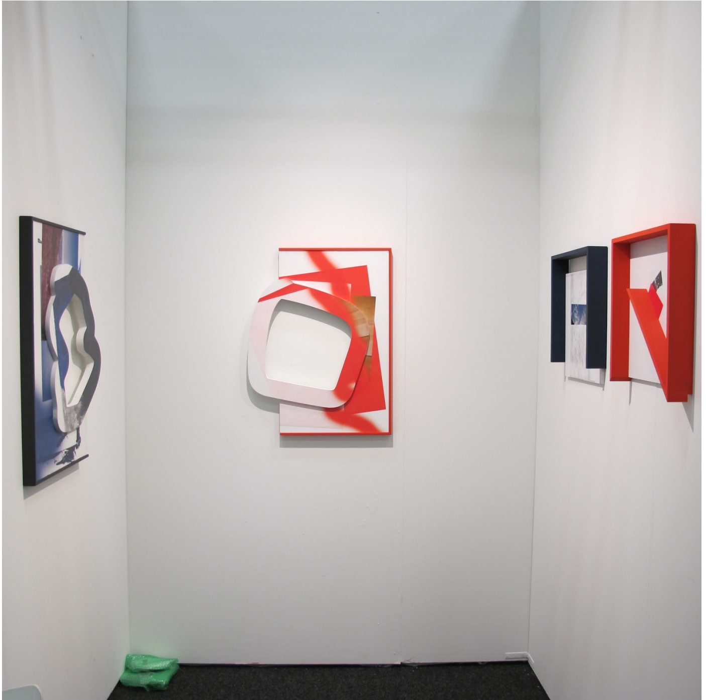
Rachel Rossin at Signal Gallery